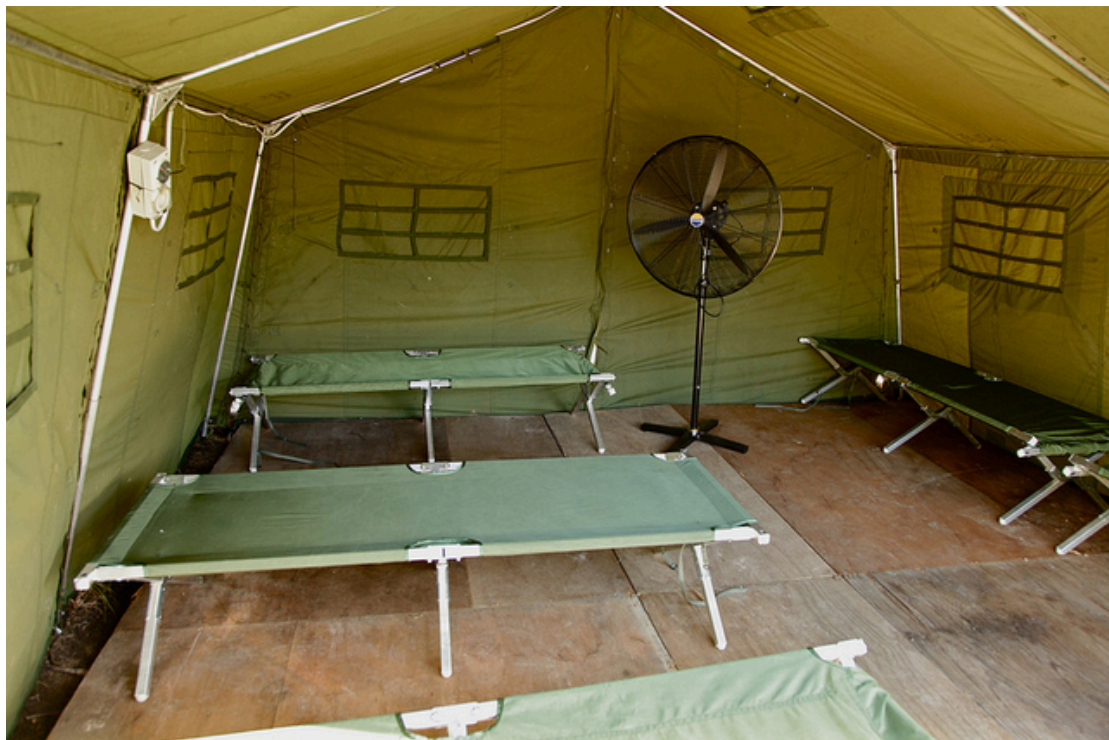
Accommodation at Manus Island.