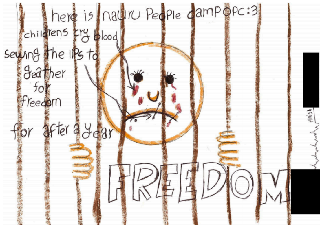
Submission No.194 to the Australian Human Rights Commission's National Inquiry into Children in Immigration Detention 2014 from a child (unnamed) detained in Nauru

An inquiry led by the Australian Human Rights Commission in July 2013 highlighted the atrocious conditions endured by women and children in Christmas Island. In their report 39 , they found 13 women on high-level risk monitoring in Christmas Island, 10 of which required 24-hour watch by a guard who sits outside their room with the door open. Women were observed at all times including when they breastfed and slept. Babies were confined in 3x3 metal containers in extreme heat with no clean, open or safe areas to learn to crawl 40 . Most children were reportedly ill with chest or gut infections. Internationally respected Professor Elizabeth Elliott stated that Christmas Island's proximity to a phosphate mine means that the physical environment was 'totally unsuitable and children suffer from recurrent asthma and irritation of the eyes and skin is common'. 41