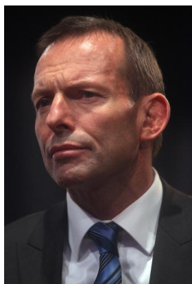
Prime Minister Tony Abbott

“This is a test of wills and Australia has lost. What counts is what the Australian government does, not what it says. It is time for Australia to adopt turning the boats as its core policy.” 1