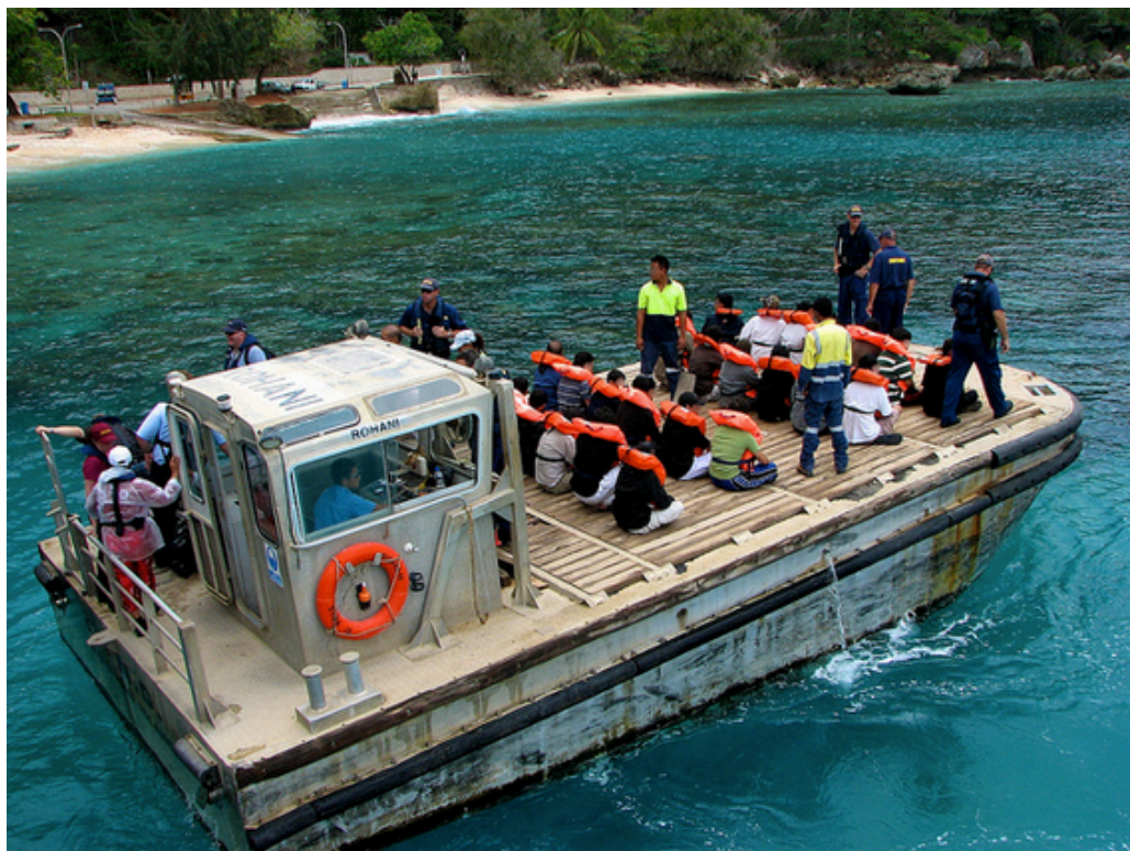
A boat at Christmas Island.

Further, the Australian government has allegedly returned asylum seekers having assessed and rejected their claims at high seas by a videoconference, bringing into question the lack of fair opportunity for an individual to fully present their case 25 . The secret screening and detention processes taking at sea in this regard have further attracted grave concern as to the human rights violations and treatment of the asylum seekers found on the boats. Reports by ABC on 22 January 2014 showed asylum seekers being treated for burns on their hands, which were allegedly caused by being forced to hold a hot exhaust pipe on the boat as punishment for protesting about access to the toilet 26 .